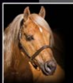
3 MILLION DOLLAR SIRE