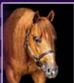
2X NRBC CHALLENGE CHAMPION