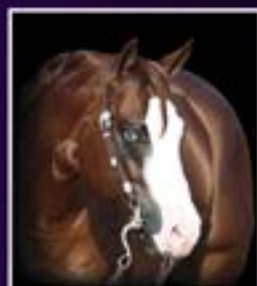
5.9 MILLION DOLLAR SIRE