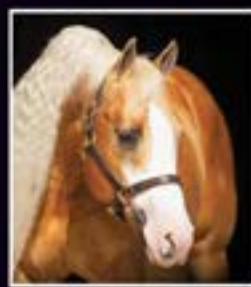
MILLION DOLLAR SIRE