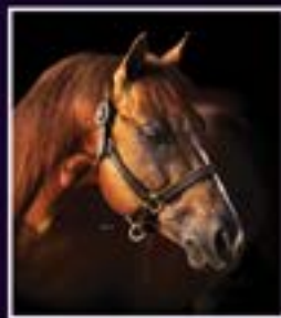
NRHA L4 OP FUTURITY CHAMPION