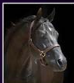
NRHA & NRBC NP DERBY CHAMPION