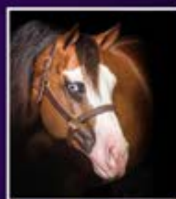
NRHA OPEN L4 FUTURITY CHAMPION