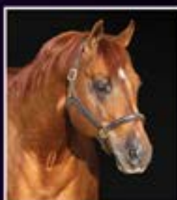
NRHA FUTURITY L4 OP RES CHAMPION