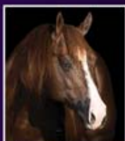
NRHA FUTURITY L4 RES OP CHAMPION