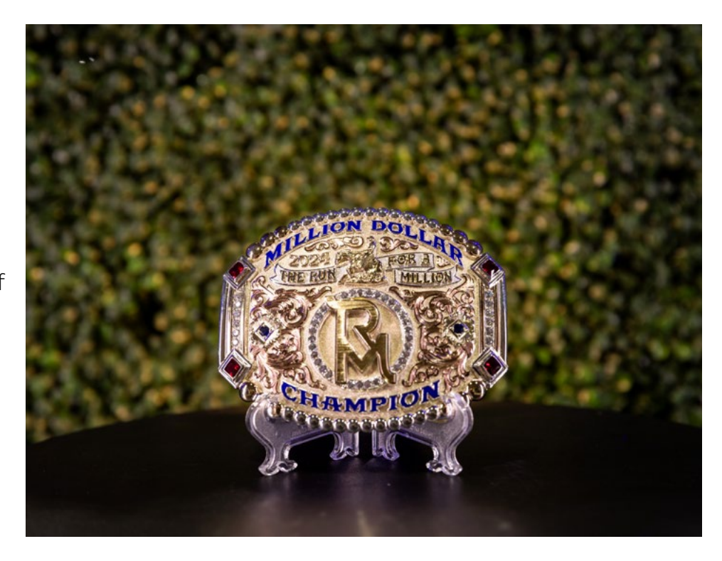
Cover:  TOC: